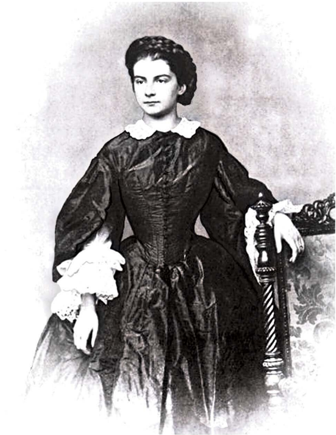
Maria Sophia Wittelsbach (shown) was Queen Consort from 1859. Elisabeth Wittelsbach, the wife of Conrad and mother of Conradin, was Queen from 1250 to 1254. Her story is told in Chapter 17.